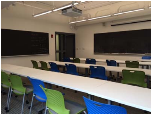
The old 216 Classroom