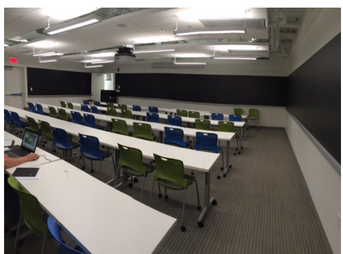
The new BIO Classroom