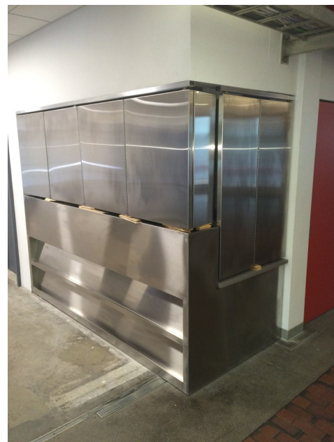
New Security Desk

The new space, located just across the hall north of their current location, will be a great addition to the Science Center, as the space will double as a main office for the North Yard Security Team. This project is scheduled for completion by August 14, 2015.